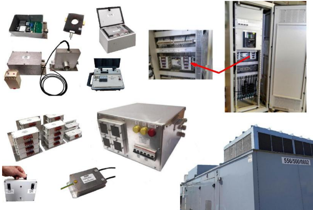
Fig. 5. EMP protective means developed by author: power transformer protection, power main DC simulator, protection of control cabinets with electronic digital equipment, special EMP filters for civil equipment, automatic reserve EMP protected battery charger for electrical substations, Ethernet telecommunication protective module, and even protective means for high power backup diesel generators.

In accordance with the specific strategy for the protection of civilian infrastructure previously proposed by the author, he also developed specific means of protection, which are installed in trial operation and have already been tested in several electrical substations during 2 – 3 years, Fig. 5.