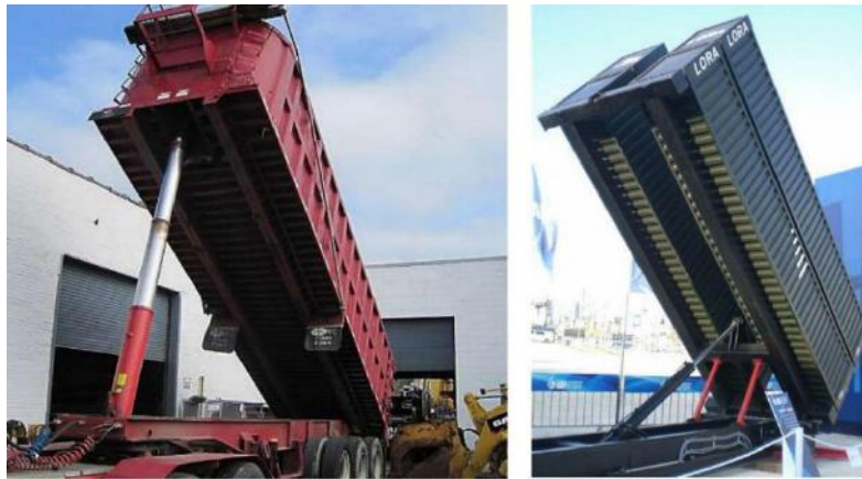
Fig. 3. A conventional shipping container (left) and a LORA missile system container (right)

The danger of such systems is that they can be as close as possible to the borders of any country. With a small area of a country (for example, such as Israel), the flight time of such a missile can be so small that the missile defense system will not be able to effectively counteract. Especially dangerous are modern container-type missile systems, which are made in the form of an ordinary container with missiles hidden inside. Such a system is, for example, the Israeli LORA system (Long-Range Artillery Weapon System). The launcher of such a system differs very little from a conventional shipping