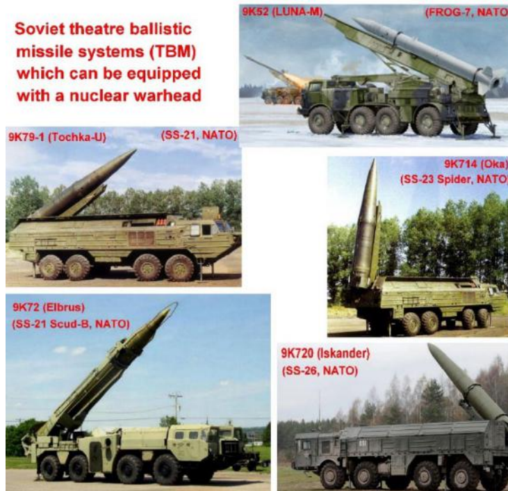
Fig. 3. Soviet/Russian theatre ballistic missile (TBM) systems which can be equipped with a nuclear warhead (explosion yield up to 200 kt).

Secondly, it appears that it is not that simple and that missile systems have been in existence for some time that an anti-missile system is not capable of defending against, that is to say it is not possible to protect the national infrastructure from HEMP attacks. What sort of systems are these then? First of all, these are theatre ballistic missile (TBM) systems which can be equipped with a nuclear warhead, Fig. 3.