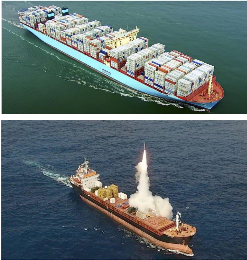
Fig. 4. An ordinary civilian container ship loaded with hundreds of standard containers and a LORA rocket, launched from a ship with containers during a test launch.